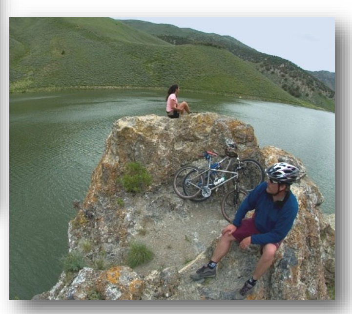
#2 Cahill Canyon (Lander County) #3 Humboldt County

Held annually in June, in beautiful Ely, the Fears, Tears, and Beers Mountain Bike Enduro Race is a unique mountain bike race patterned after motorcycle enduro. It is the longest running mountain bike enduro in North America and one of the toughest, covering 40 miles and some 6000' feet of climbing. Events are held at every rider level (Fun Run, Beginner, Sport, Expert, and Pro) with timed section in each event. The race ends with music, food, and celebration at Broadbent Park. More information .