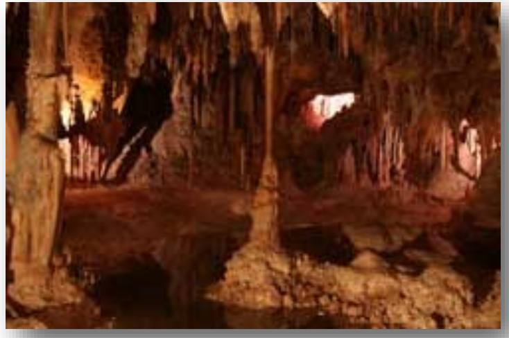
Great Basin National Park, Lehman Caves

Located just outside of Baker and shadowed by Wheeler Peak, Great Basin National Park is one of the least visited but most impressive National Parks. The park offers many different and impressive ways to take a stroll. Take a walk up Wheeler Peak for an impressive view, or saunter through ancient Bristlecone Pines. For a truly different walk, stroll underground through Lehman Caves, home to rare impressive shield formations. After your walk, be sure to enjoy a one of a kind homemade ice-cream sandwich at the Lehman Caves Café. More information.